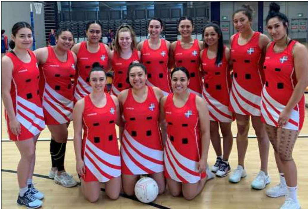
MSP's FIRST NETBALL TEAM, which is made up of partners, relations and friends of MSP club members, made their grade final in their inaugural year.